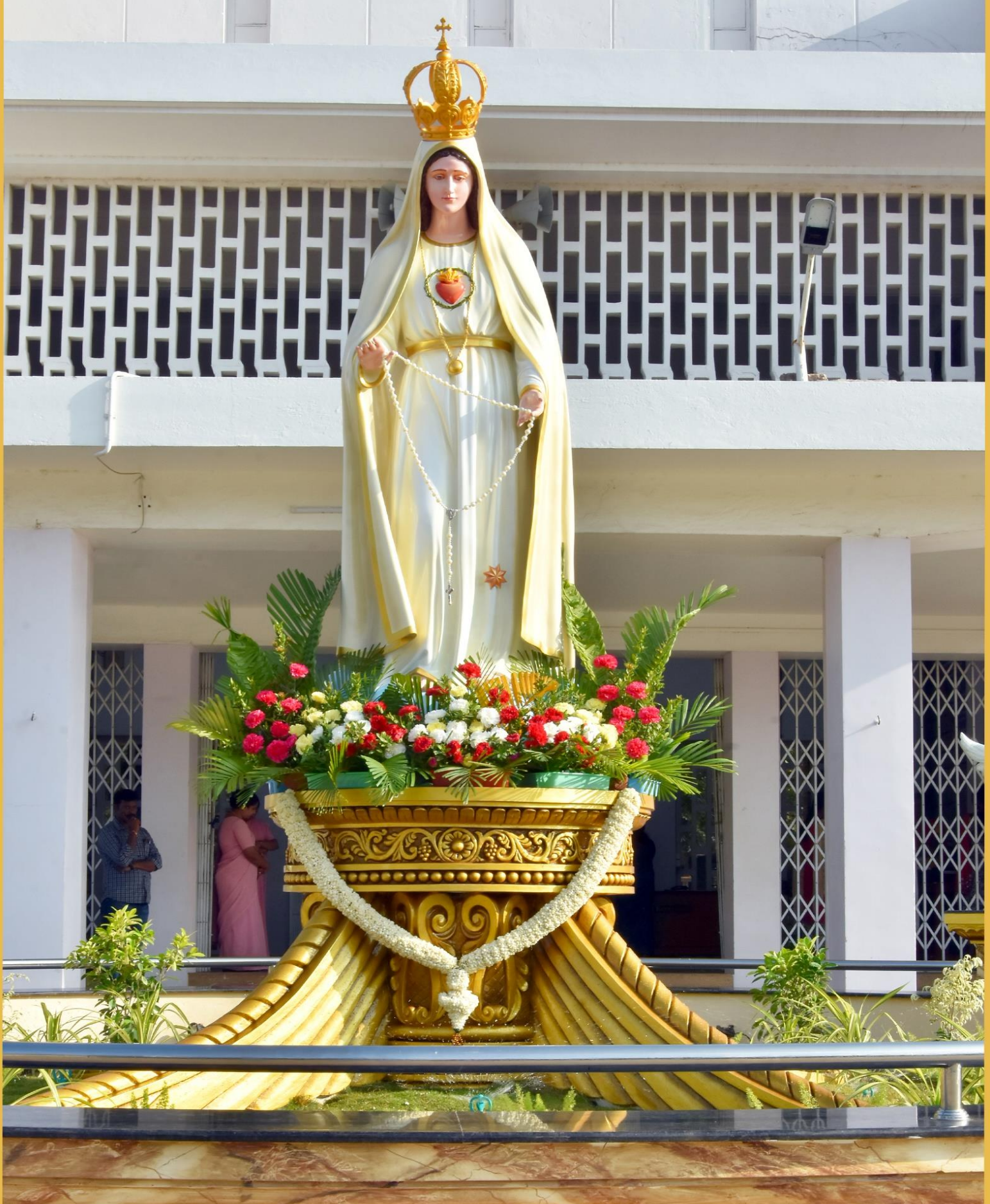
Centenary Celebration - Apparition of Our Lady at Fatima (1917): Installed on 11.02.2019.