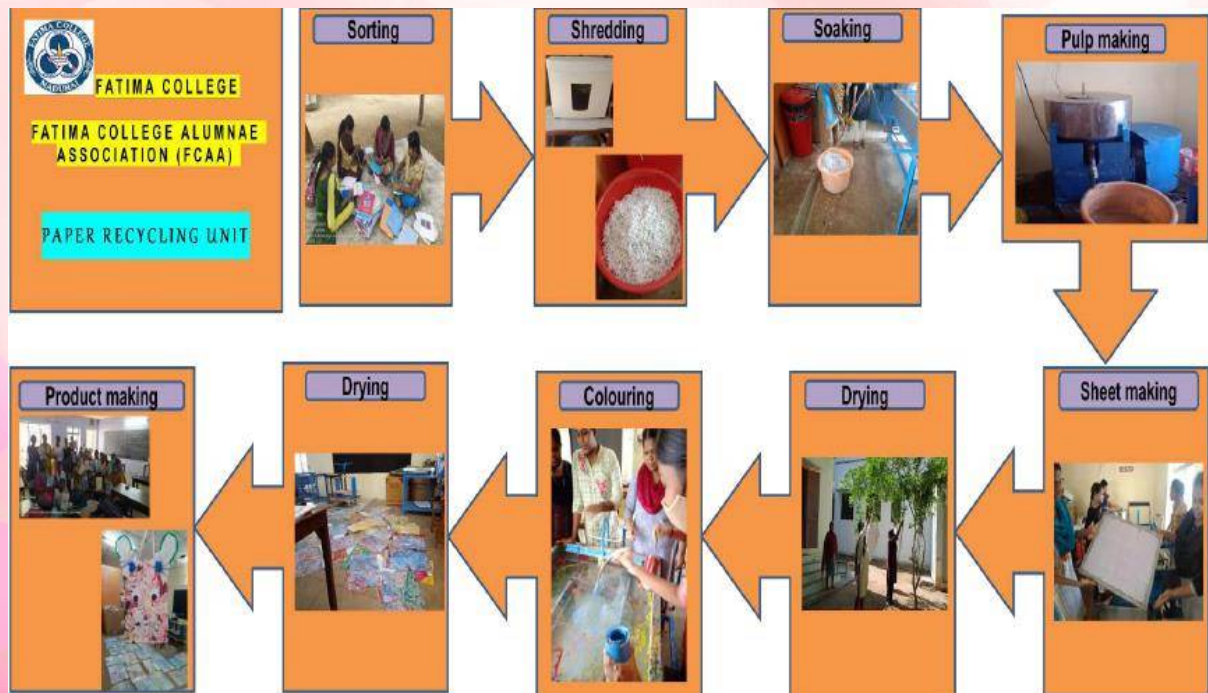
Processing flowchart in Paper Recycling

The paper recycling unit functions effectively by honing the latent entrepreneurial skills of the students of Entrepreneurial Development Cell. The unit also organises special training programmes and short term courses. The students are also motivated to make paper products.