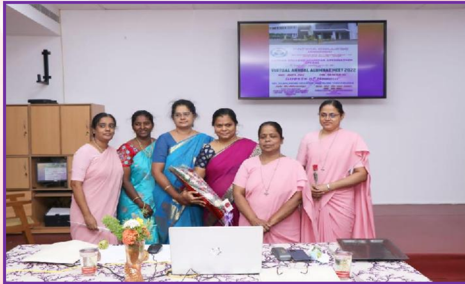
Newly elected office bearers of FCAA