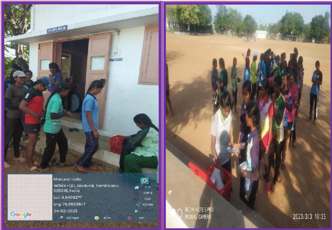
Distributing nutritious Soup to the sports students

An initiative of FCAA that attempts to offer hygienic and nutritious soup to the sports students of Fatima College who unceasingly bring accolades to the institution. In the academic year 2022-2023, more than 50 sports students benefited from soup Kitchen