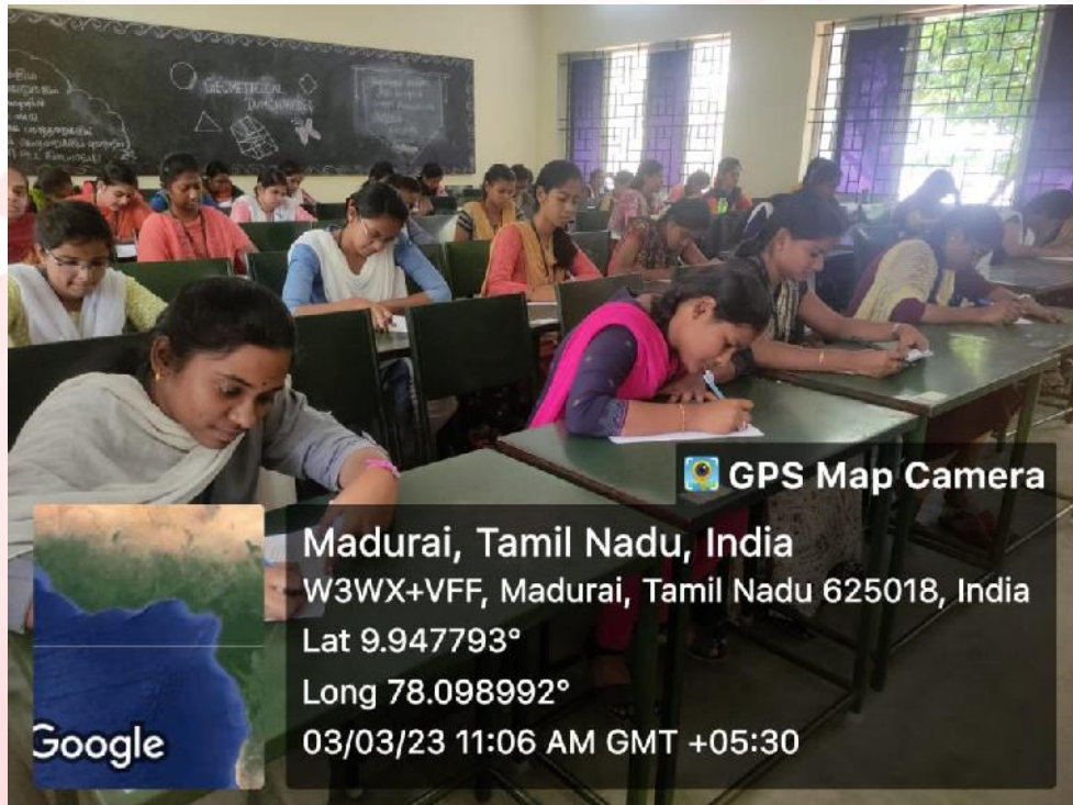
Students taking part in the written Aptitude test