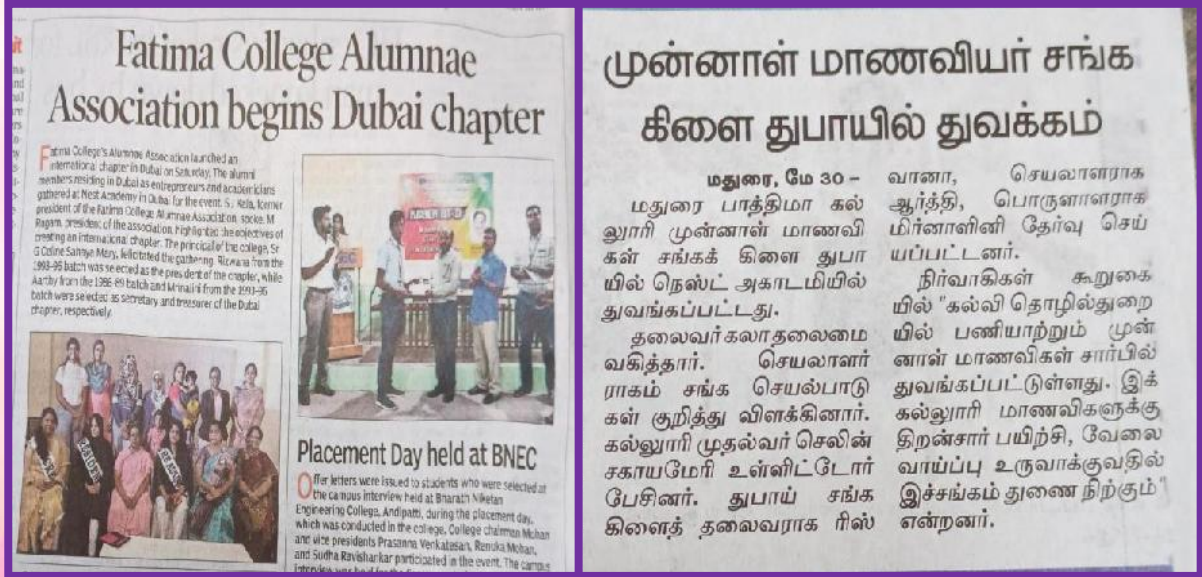
Glance of Newspaper clippings of Dubai chapter