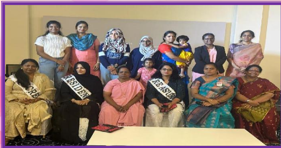
Launching of FCAA Dubai Chapter