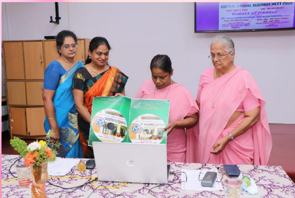
Release of the Alumnae Newsletter 2021 - 22 by the Principal