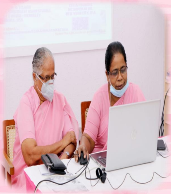
SECRETARY& PRINCIPAL ONLINE WITH THE ALUMNAE