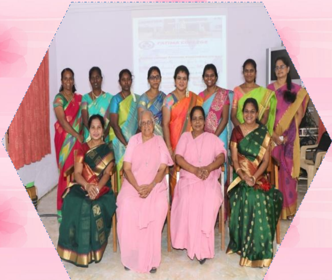
FCAA OFFICE BEARERS WITH SECRETARY & PRINCIPAL