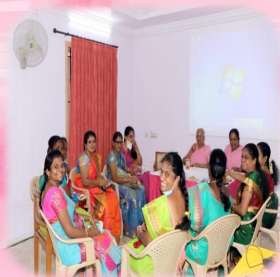
CHERISHING JUBILANT MOMENTS